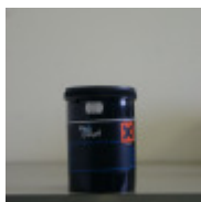
BOTTLE OF 1 KG